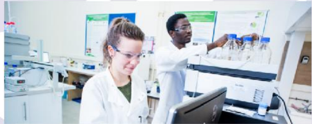
NHC Strategic Plan 2018-20